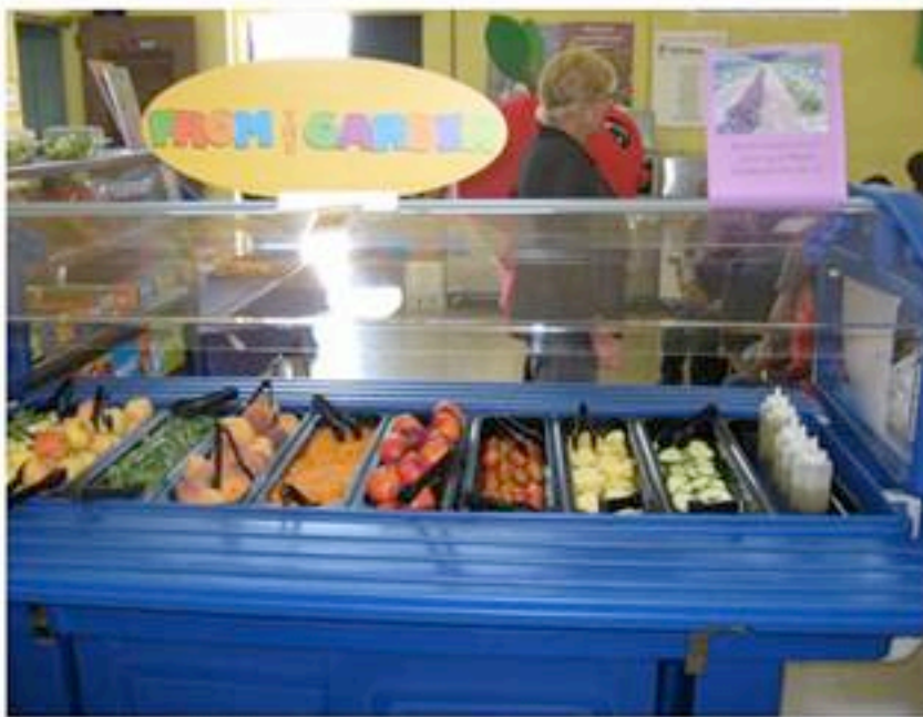
Fruit & Veggie Bar, Little Elementary, Pawtucket